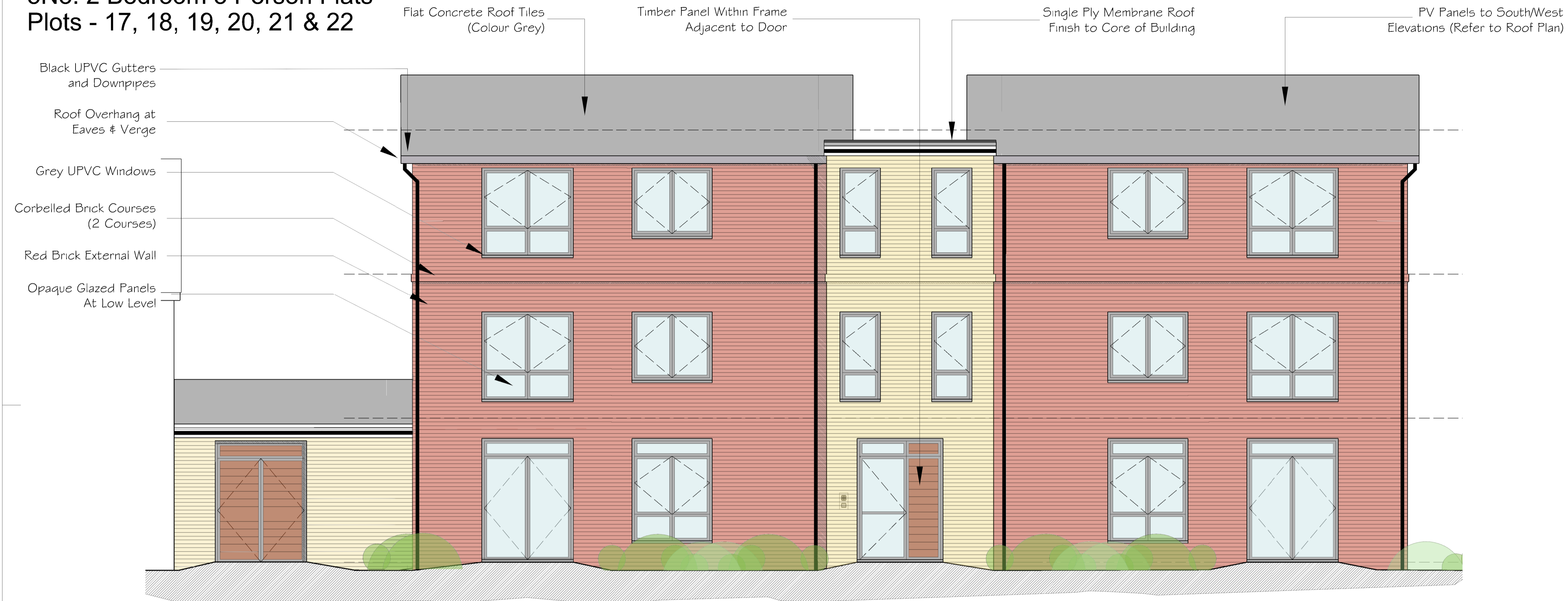
Elevation CC (1:50)

1 No. 1 Bedroom 2 Person Flat 5 No. 2 Bedroom 3 Person Flats Plots - 17, 18, 19, 20, 21 & 22